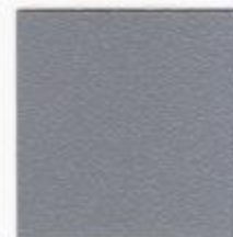
Gris 2150 Sablé YW365F