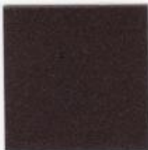
Cappadoce 2525 YW268I