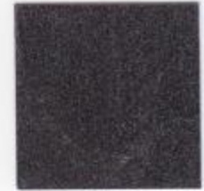
Manganèse 2525 YW280F