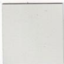
Otago 2525 YW263I

A calm palette of light pastels, tinged luminous whites, beiges and pale greens, extending to silvery or subtly pinkish grays. Textures go from satin to softly shiny, sequined or illuminated with pearlescent reflections.