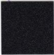
Noir 2300 Sablé YW383I