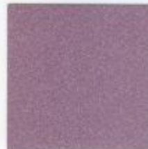
Valparaiso 2525 YW285G