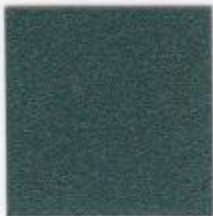
Vert 2500 Sablé YW354F