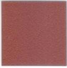
Orange 2100 Sablé YW386I