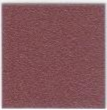
Rouge 2100 Sablé YW371F

The palette of dense and pigmentary tones centers on amber-y caramels, burnt reds and burgundies, chocolate browns and khaki greens, inspired by natural ingredients. Textures are satiny or ultra-glossy, matte or sanded.