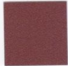
Rouge 2600 Sablé YW380I