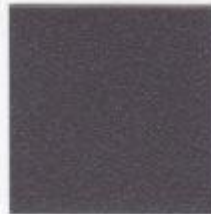
Gris 2900 Sablé YW355F