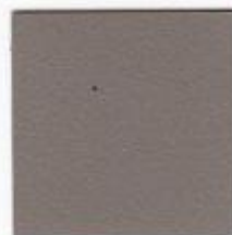
Gris 2800 Sablé YW356F