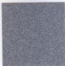
Starlight 2525 Sablé YX353F