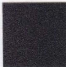
Noir 2100 Sablé YW359F