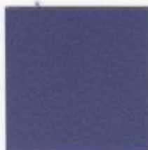
San Francisco 2525 YW277F