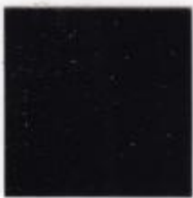
Mangalia 2525 YW269F

Textures are lacquered, shiny or satiny, sequined or metallic, all the way to mirror reflections.