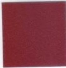
Bromo 2525 YW269I