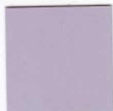
Kura 2525 YW265I