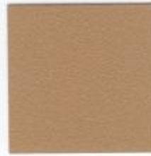
Ambre 2525 Sablé Y2316F

The palette pivots on metals: gold, brass, bronze, petrol black and copper, in intense shimmers and shot reflections. Textures are precious, from satiny to lustrous, or as shiny as mirrors.