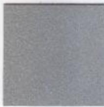
Shilin 2525 YW213G