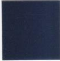
Canon 2525 YW279F