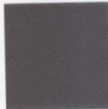
Gris 2700 Sablé YW382I