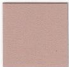
Atacama 2525 Sablé YW385I