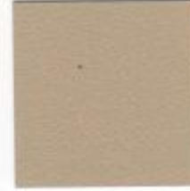
Yuma 2525 Sablé Y2317F