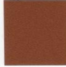
Ordos 2525 Sablé YW387I