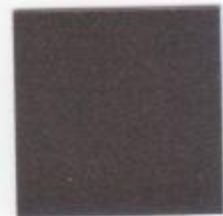
Platine 2525 YW284F