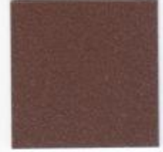
Patah 2525 YW267I