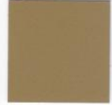
Jaisalmer 2525 YW273F