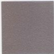
Gris 2500 Sablé YW358F