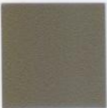
Vert 2100 Sablé YW381I