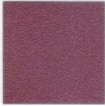
Rouge 2200 Sablé YX310I