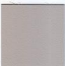
Yazd 2525 Sablé YW370F