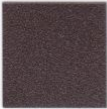
Brun 2650 Sablé YW368F