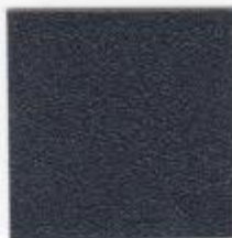
Bleu 2600 Sablé YW361F