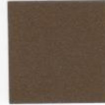
Bronze 2525 YW283F