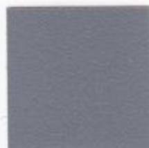
Gris 2400 Sablé YW373F