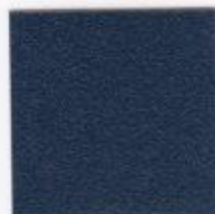
Bleu 2700 Sablé YW353F