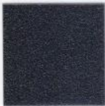
Noir 2200 Sablé YW360F