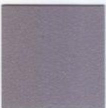
Sonora 2525 Sablé YW379I