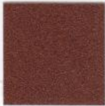
Mars 2525 Sablé YX355F